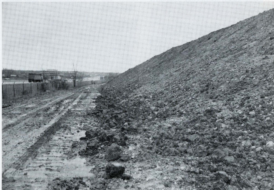
A research goal of the Urban Vegetation Laboratory will be to select and breed plants able to survive on inhospitable sites such as this berm (constructed mainly of fill material) along the East-West Tollway in the Arboretum. A series of such berms is being built to protect the Arboretum's plant collections from adversities caused by salt spray and other tollway-related pollutants.