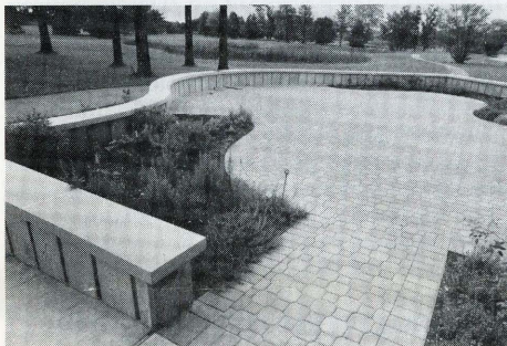
The Woody Herb Garden

The east side of the Research Building extends a welcome to an intimate patio in and around which is nestled a garden of woody herbs. This garden, designed by Landscape Architect Tony Tynnik, demonstrates the many uses of herbs in creating pleasant landscape effects. As the garden matures, it will become a uniquely picturesque landscape of varying foliage and flower color, handsome plant forms, pleasant fragrances, and delightful textures. This subtle blending of texture, color, and form will encourage visitors to understand better the distinct qualities of each species and how they can add new charm to landscapes. A leisurely visit with time to enjoy the garden's beauty, study the plant characteristics, and sense their associations in composition will provide the greatest reward.